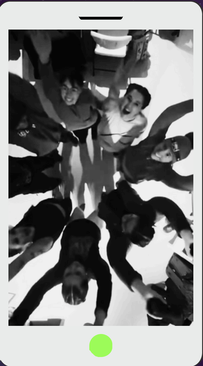
2024 Wellness Retreat

https://www.instagram.com/p/C3QGc_vrWpa/