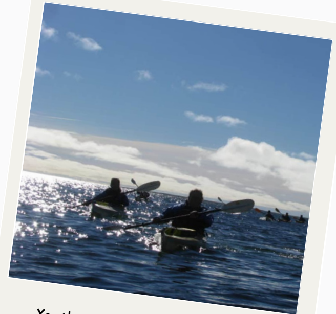
Youth paddling in Chesterfield Inlet

"Teach more people how to build [qajaqs] so other communities will know how to do it and more kids know how, and so no one forgets how to build them" - Youth Participant