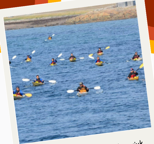
Youth paddling just off Igluligaarjuk (Chesterfield Inlet)

Being out on the land and water supports physical and psychological wellbeing. Graduates of the program, who are often headed to college or university are encouraged to come back and help as assistant instructors, they receive an honorarium for their time.